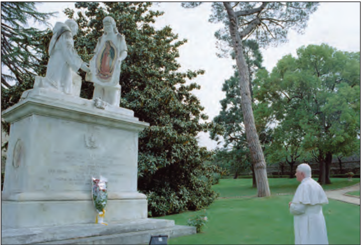
Benedict XVI before a statue of Saint Juan Diego presenting the sign to Bishop Fray Juan de Zumarraga, Vatican City